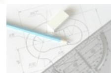
Paper to Cad Conversion